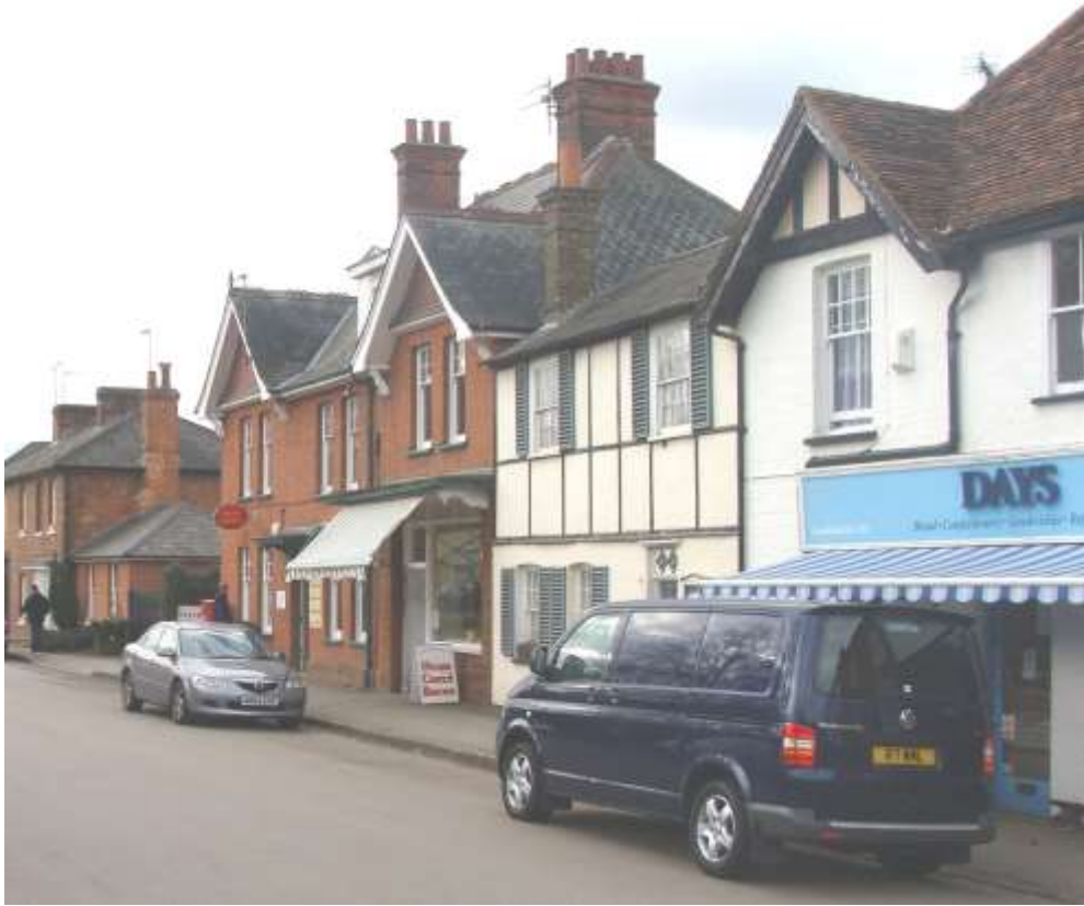
Picture 5 – Group of interesting non-listed properties, High Street, worthy of protection and retention.

6.18. Nos.15-19 High Street, east side. 19 th century 2 storey gault brick group of cottages with slate roof and 3 no. distinctive decorative chimneys with original pots. Date plaque inscribed E Knight 1891. Some original windows remain. Despite other window replacements and other alterations, enough of historic and simple architectural qualities remain to warrant inclusion. An Article 4 Direction to provide protection for chimney features may be appropriate subject to further consideration and notification.