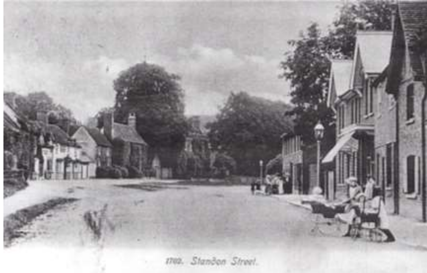
Picture 1 – High Street, probably early 20 th century (reproduced courtesy of Hertfordshire Archives and Records).

Interesting features noted on this map include the railway line and station; a Windmill to the south of Hadham Road, opposite the Almshouses; a school for Boys and Girls at Knights Court; the Paper Mill at Paper Mill Lane; a Corn Mill at Mill End; a brewery at Mill End ; a large building called The Vicarage opposite New Street Farm on New Street (now Kents Lane) and a Smithy on the High Street.