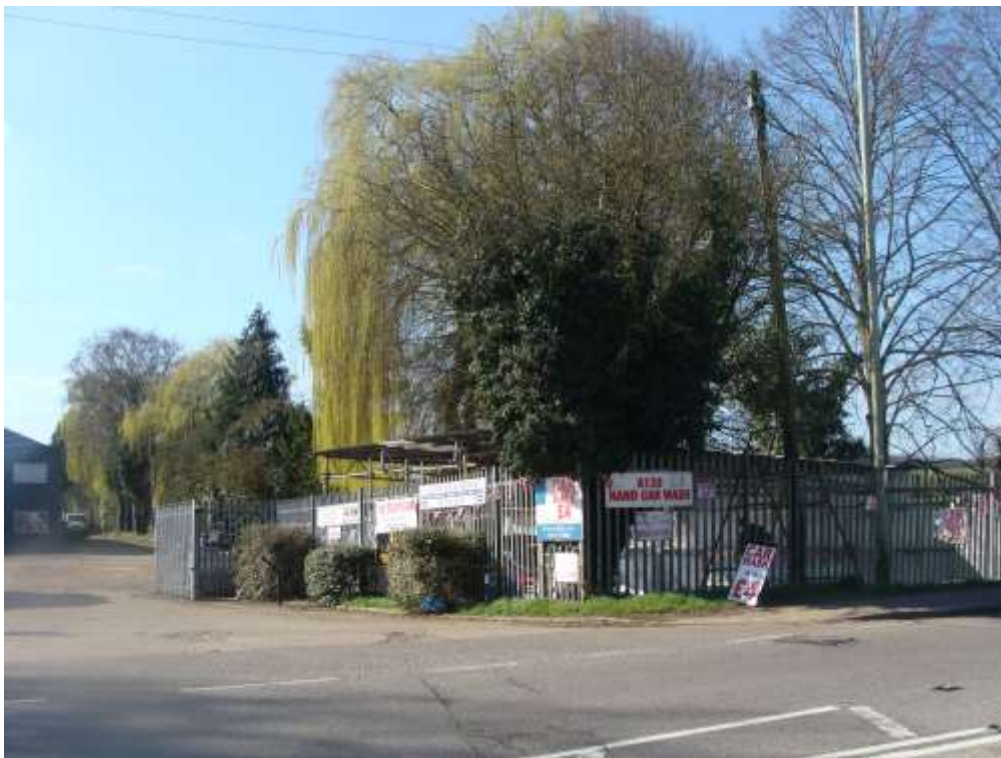
Picture 10 – Entrance to Industrial estate seriously detracts and is in need of comprehensive improvement.

6.76. Opportunity to secure improvements. It is suggested discussions take place with the landowner of the commercial area with a view of implementing comprehensive improvements to its entrance, undertake other improvements including a general tidy up and under planting of its western boundary. Additionally seek to reduce the impact of the large agricultural buildings to the rear of New Street House and farm office by additional landscaping; reduce the impact of signage to the China Garden Restaurant and improve the ‘landscaped’ area at the junction of Station Road/ Kents Lane.