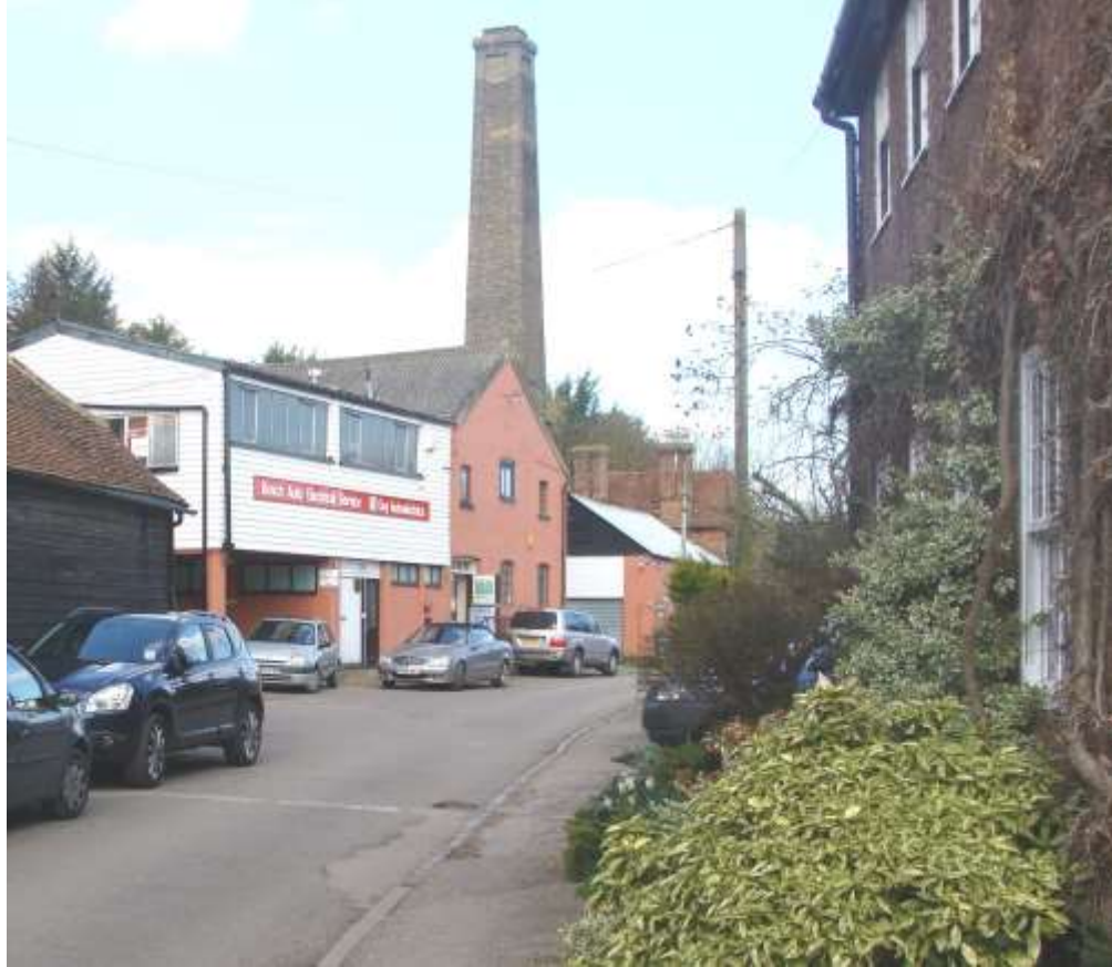
Picture 7- Distinctive chimney, Mill End.

6.49. Other distinctive features that make an important architectural or historic contribution. There are two walls, the first being attached to the converted barns of The Granary, Mill End Farm that is of flint construction and about 1.7m in height. It is covered in ivy that needs careful removal. The second is a short length of wall about 1m in height, with rounded brick capping on the access to Old Mill House, a Listed Building. The walls are protected from demolition without prior consent by virtue of being adjacent to a footpath and within the curtilage of a Listed Building, respectively.