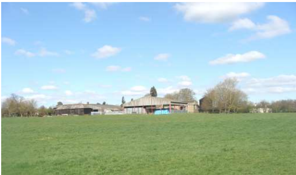
Picture 8 – Large scale agricultural buildings dominate landscape and detract when viewed from public footpath; additional landscaping is suggested.

6.57. General overview. The historic buildings to the frontage of Kents Lane are an important architectural entity in this part of the Conservation Area. However the large scale agricultural buildings to the rear that are dominant in the landscape, detract. The open pasture land extending to Paper Mill Lane forms part of the open countryside and is traversed by a well used public footpath from which the industrial area west of the River Rib can be seen through gaps in its boundary hedge.