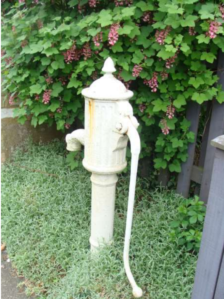
Picture 12 – One of 2 no. 19 th century cast iron Pumps, Stortford Road, that are considered worthy of being ‘Listed’.

6.85. Important open land, open spaces and gaps and particularly important trees and hedgerows. There are is a boundary hedge and trees to the north side of Stortford Road