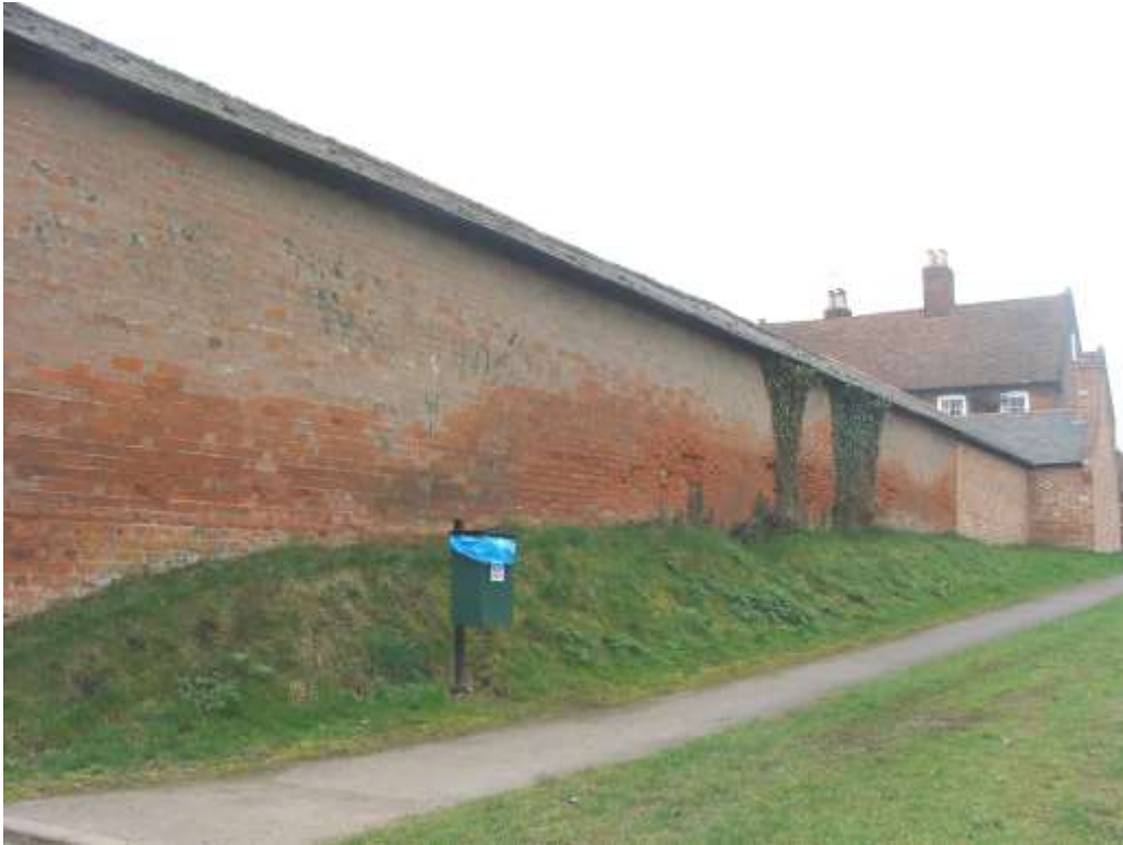
Picture 9 – 19 th century agricultural barn, important element in approach to village, sensitively rebuilt in part.

6.64. Other distinctive features that make an important architectural or historic contribution. The following walls add to the character of this part of the Conservation Area - 19th century gault brick wall of Flemish bond in excess of 1m in height with quality capping stones by Doulton and Company. Protected from demolition without prior consent virtue of height and within curtilage of the Bell PH, a Listed Building.