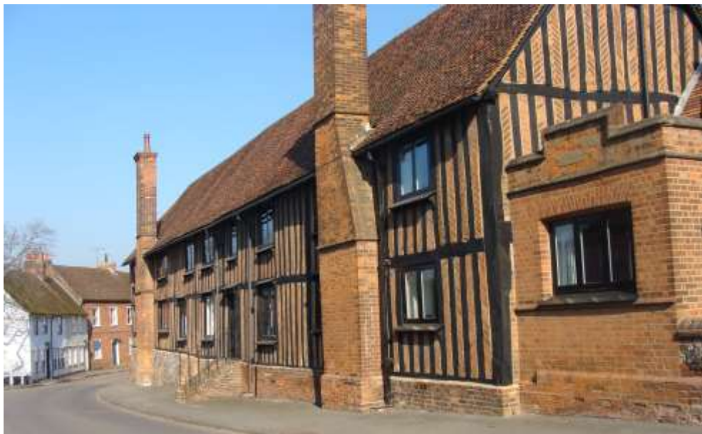
Picture 4 - Knights Court dating from 16 th century, re-fronted in 19 th century.

6.5. Individually Listed Buildings. In total there are approximately 30 individually listed buildings within this area, of which 22 are in the High Street, 5 in Hadham Road and 2 at the junction of Paper Mill Lane. Of particular importance is the group clustered around the church. The latter with its detached tower, described as being ‘unique in the County’, is listed Grade I. Close by is the Grade II* Knights Court, possibly a manorial courthouse dating from the 16 th century or earlier with its steep tiled roof and continuous jetty on north side facing the churchyard. Also in this general area is 59 High Street (Standon House), an impressive Grade II* Queen Anne House overlooking the Market Place of the former Borough. The remaining buildings generally date from the 17 th century with some having been re-modeled at later dates. In this respect Church End Cottages which date from this period have been ‘Gothicized’ during the 19 th century and form a particularly attractive picturesque group.