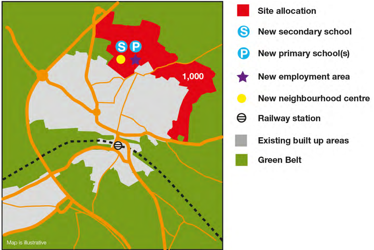
Figure 9.1: Key Diagram for Ware

9.2.2 Reflecting the District Plan Strategy, the following policies will apply to applications for new development in Ware: